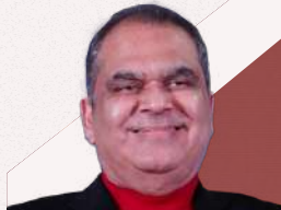
Mr. Sanjeev Arora- Cabinet Minister Of Industry & Commerce.

Intext Expo is a timely initiative that brings together key pillars of the industry under one roof. A vision that drives connection, progress, and future-ready development.